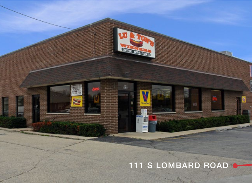
111 S LOMBARD ROAD

Conveniently located in the Central DuPage submarket. This location provides quick access to Rohlwing Rd, Fullerton Ave and Army Trail Blvd.