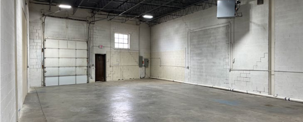
Pictured: Unit 3 Make-Ready Work Complete